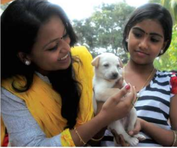
A puppy which was adopted at 'My Desi Valentine' adoption drive at Manaveeyam Veedhi on Saturday.

Many who wanted to take home a little ball of fur at the drive, had to return empty handed. For once, Indian breeds were in demand, with the